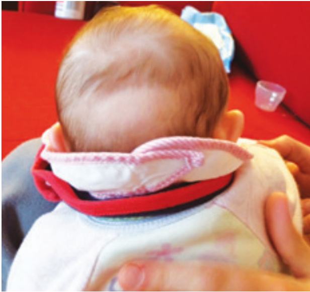
Figure 1. Right-sided cephalohematoma seen by family doctor during an office visit.