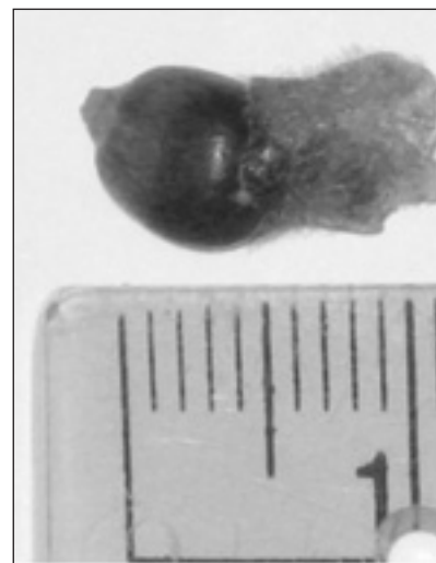
Figure 2. Kernel (6 mm diameter) with glue attached after removal from ear canal.

“Adequate visualization, appropriate equipment, a cooperative patient, and a skilled physician are the keys to successful foreign body removal.” 1 Along with these requirements, the literature identifies numerous specific risk factors for complications of ear canal foreign body removal.